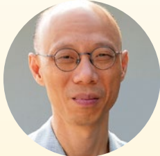
Mr WONG Kam-sing

Secretary for the Environment, Environment Bureau, Government of the HKSAR