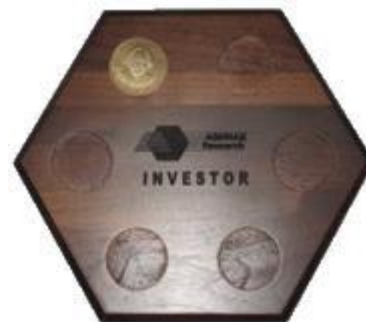
( Antique Coin with Plaque)

12. In addition, the company sponsor who raised a certain amount, they will be recognized on our newsletter, Facebook, HKC website & event banner and publication to all HKC members: