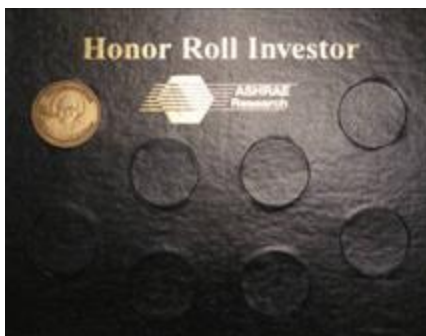
(Antique Coin with Holder) (Remark: *Plaques and holders are provided to new donors.)